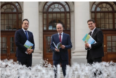
10 Climate Action

Festive gift ideas for your favourite business type, and some suggestions that clients and customers will appreciate, too