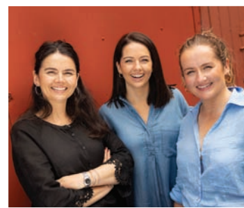
60 Kate's Kitchen